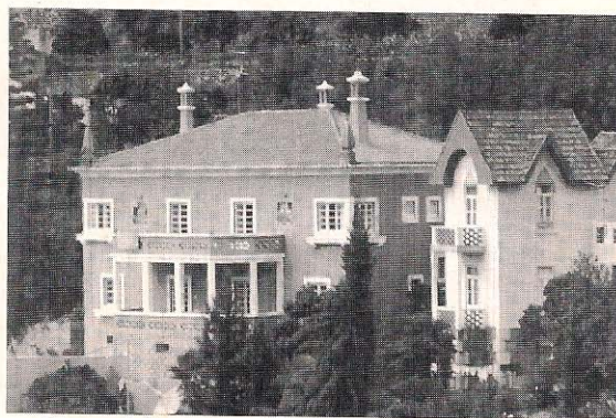
Viewed from any direction, a splendid and inviting guest house.

women to stay at Casarao Cinzento, we felt very welcomed and at ease. The other couple (male) staying during the same week were pleased to meet new faces, and it was fun to "double date."