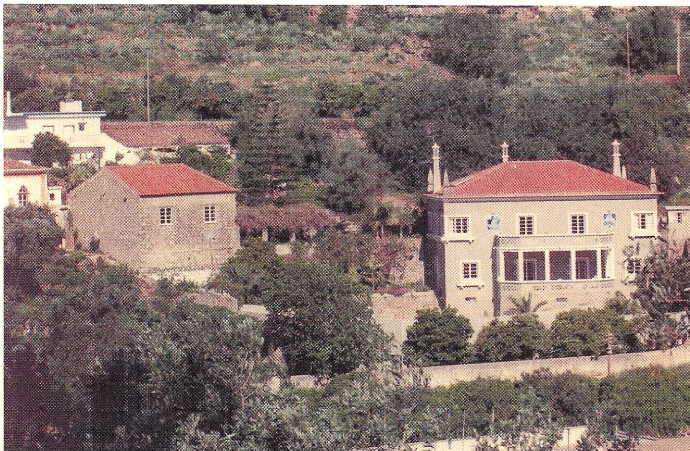
Meticulously restored Casarao Cinzento (Grand Grey House), a classic mansion sitting among the verdant rolling hills near Portugal's Caldas de Monchique.

T ake a radical change of pace from a hectic lifestyle and discover the beautiful scenery of Portugal's Serra de Monchique. Situated several kilometers above the Algarve coastal town of Portimão, this land of mountain peaks, fertile valleys, nestling villages and mineral spas will soothe away anxiety and smooth that furrowed brow.